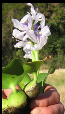
Water hyacinth may have flowers, unlike water lettuce