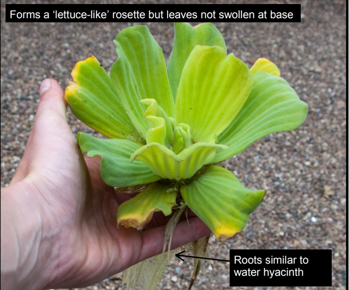
Roots similar to water hyacinth