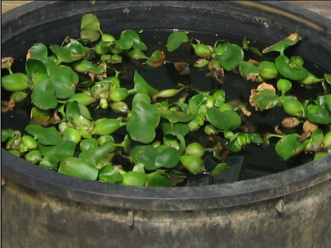
Eichornia crassipes (water hyacinth) For comparison

There are not many plants likely to be confused with water hyacinth, especially if it is in flower. However, it might be confused with other large floating plants such as water lettuce.