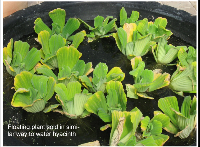
Floating plant sold in similar way to water hyacinth