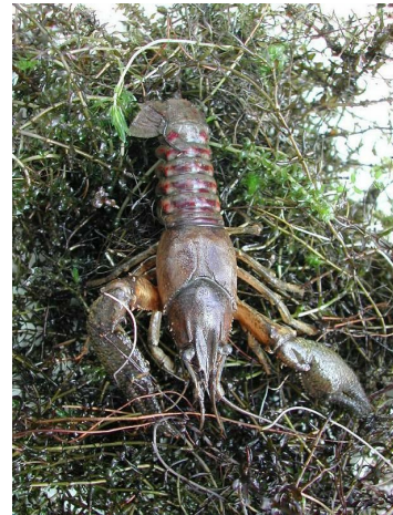
Orconectes limosus (spiny cheeked crayfish)