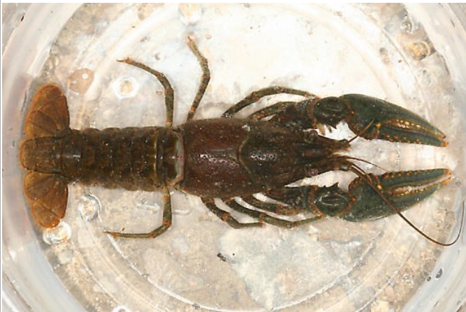
Orconectes virilis (virile crayfish)