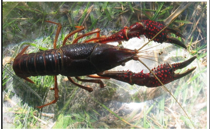
Procambarus clarkii (red swamp crayfish)