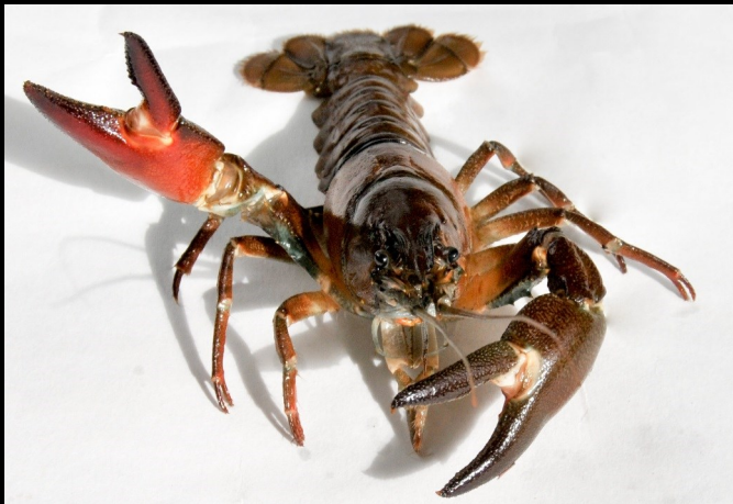
Pastifastacus leniusculus (signal crayfish)