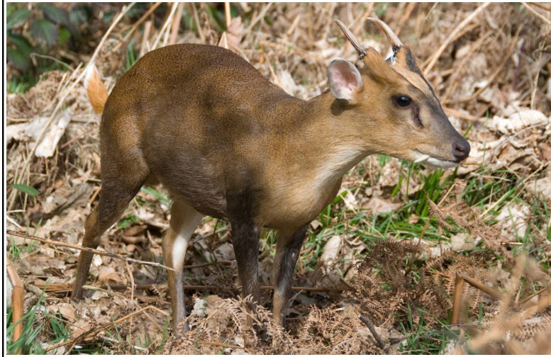
Muntiacus reevesi (Muntjac deer) (for comparison)