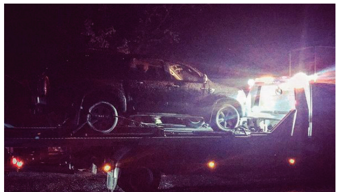
The vehicle being towed away from the scene